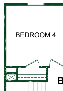
BEDROOM 4 OPTION